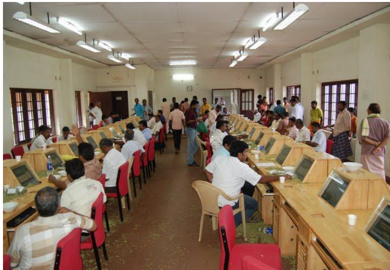
A view of Cardamom E-auction Centre

17.15 The quality of saffron depends on colour, grade, moisture etc, the cardamom model e-auction will be more suitable. Hence with the first hand experience on hand, it is proposed to set up the e-auction center for Saffron in the cardamom model.